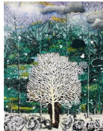
'The presence of Ancient Thunder', 2009-2010