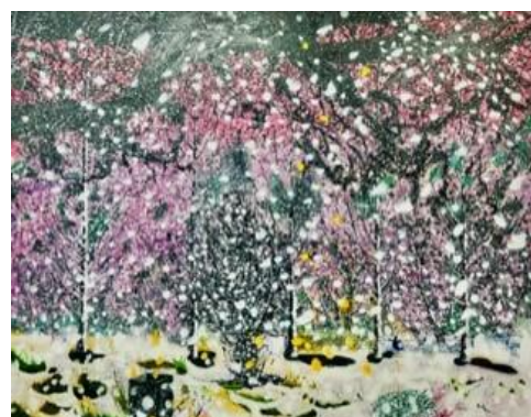
'Oasis 400 Yards', 2009