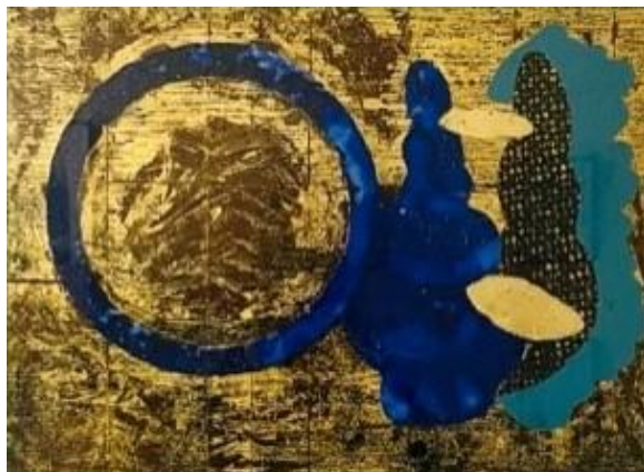
'Sitting at My Own Table, 2008