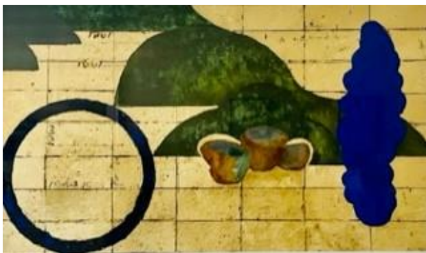
'Emptiness Accommodates Everything No. 2', 1998

This sale will include an important group of paintings by the late Knighton Hoskins